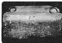
Picture of the Stone of Destiny