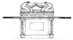
Drawing of the Ark of the Covenant